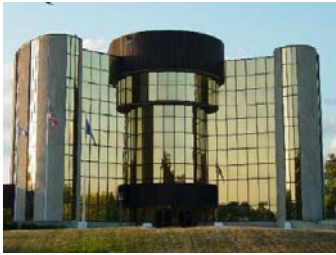
City of Livonia City Hall HVAC Renovation