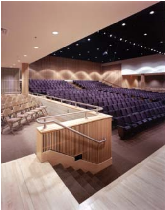
Madison High School Auditorium