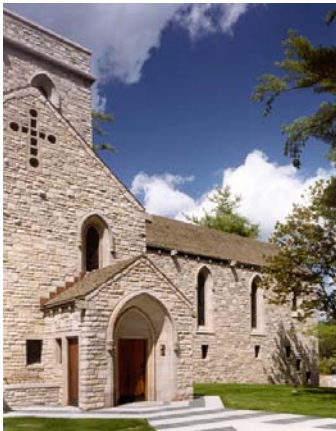
St. Hugo of the Hills Chapel Renovation