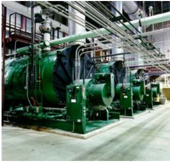
Genesys Regional Medical Center New Central Energy Facility