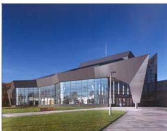
Michigan Technological Univ. Rozsa Center for the Performing Arts