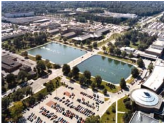
Ford Motor Company Product Development Center